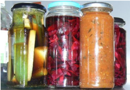
Just some of the finished produce